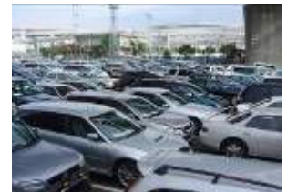
LTD, listed on the Tokyo